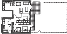
Layout Showing Provisional Garden Space